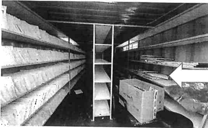
Steel shelving fixed to walls and center rack braced for