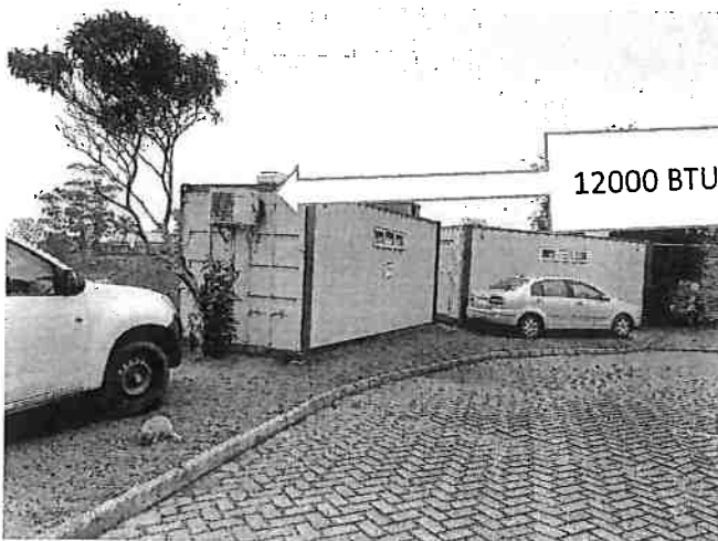
12000 BTU air-conditioned fitted