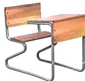
Combination Desk Saligna