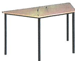
Trapezoidal Table Oak