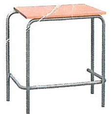
School Desk Supa Wood