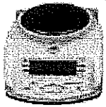
Small Pan Without Draft Shield