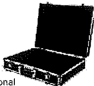
Optional Hard Carrying Case