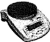
Large Pan Model (Draft shield n/a)