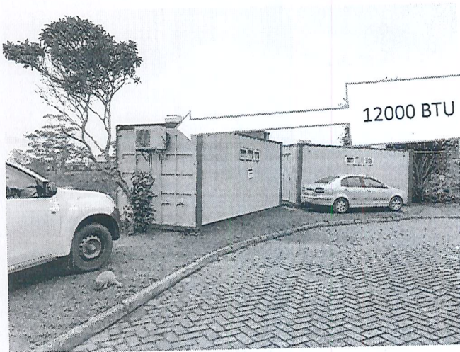
12000 BTU air-conditioned fitted