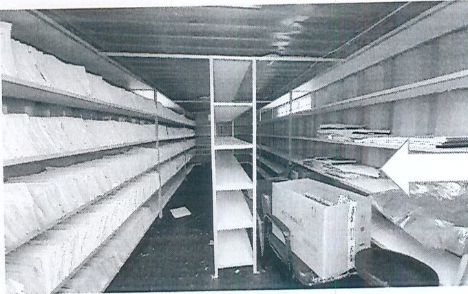
Steel shelving fixed to walls and center rack braced for