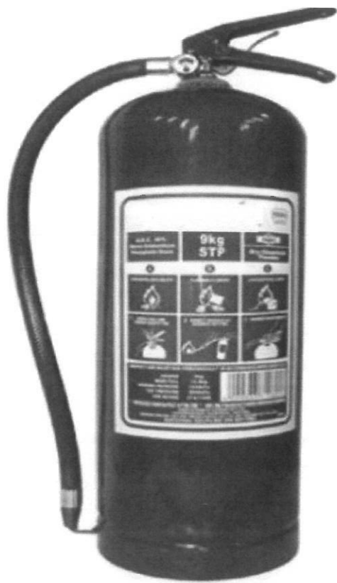
9Kg dry Chemical Powder (DCP) Fire extinguisher = 11