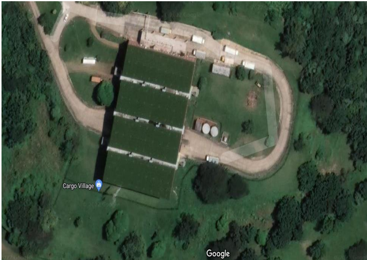
Aerial View 1: KWAZULU CENTRAL PROVINCIAL LAUNDRY