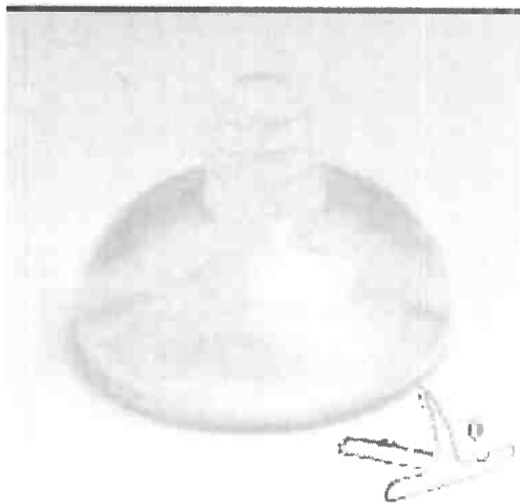
GIMA 3422 SILICONE MASK NO , NEWBORN/SMALL, PACK 1