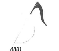
CCM001 COFFEE MACHINE JUG GLASS - NO LID - 1.8Lt