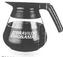
CMJ002 COFFEE MACHINE JUG GLASS - WITH LID - 1.7Lt