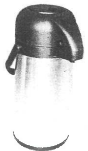
VFS0022 VACUUM FLASK S/STEEL INNER - 2.2lt