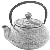
CTP0600 CAST IRON TEA POT [NIPON] (GREEN) 600ml