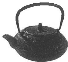
CTP0800 CAST IRON TEA POT [JAPANESE] (BLACK) 800ml