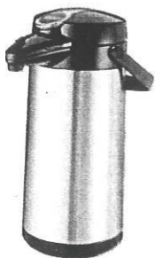
ABB0022 AIRPOT BREWER BRAVILOR - FLASK 2.2Lt