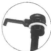
Double pump system