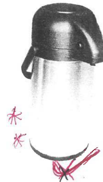
VFS0035 VACUUM FLASK S/STEEL - 3.5lt