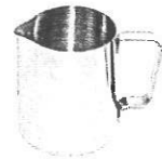
MEJ1500 MILK FROTHING JUG - 1.5lt