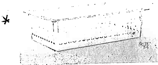
Plastic Basket with open base & sides

The PC modules constitute the basis of the logistical system. They are used to store and transport medication and goods and are interchangeable between storage systems, and transport carts.