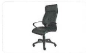
AC6 Ameira High-back Chair