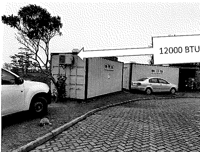
12000 BTU air-conditioned fitted