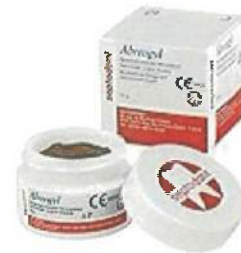
Septodont Alveogyl Haemostatic Surgical Dressing 10gms