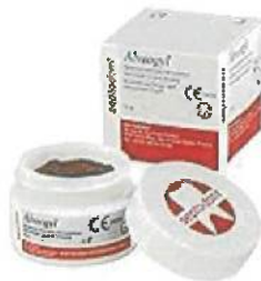
Septodont Alveogyl Haemostatic Surgical Dressing 10gms