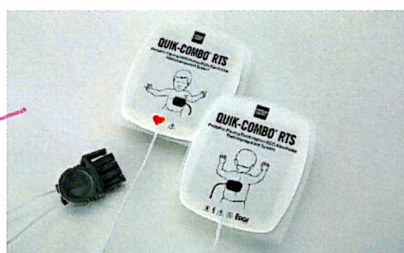
Pediatric EDGE System RTS Electrodes with QUIK-COMBO Connector

For use only with manual monitor/defibrillators; 12 month minimum shelf life at time of shipment 24 in. leadwire length. 11996-000093