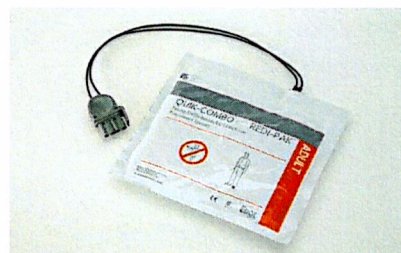
EDGE System Electrodes with QUIK-COMBO Connector and REDI-PAK® Preconnect System 42 in. leadwire length 11996-000017