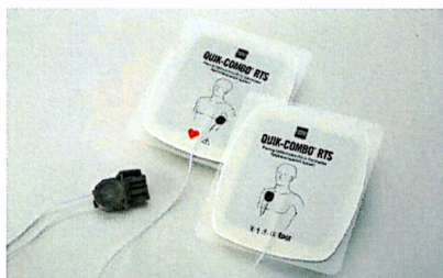
EDGE System RTS (Radiotransparent) Electrodes with QUIK-COMBO Connector 24 in. leadwire length 11996-000090