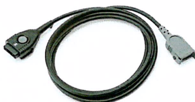
QUIK-COMBO Therapy Cable

For use only with manual monitor/defibrillators; 12 month minimum shelf life at time of shipment 24 in. leadwire length. 11996-000093