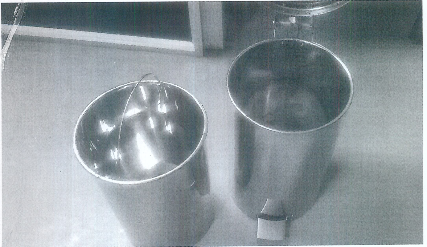
20LT STAINLESS STEEL PEDAL BIN AND STAINLESS STEEL BUCKET