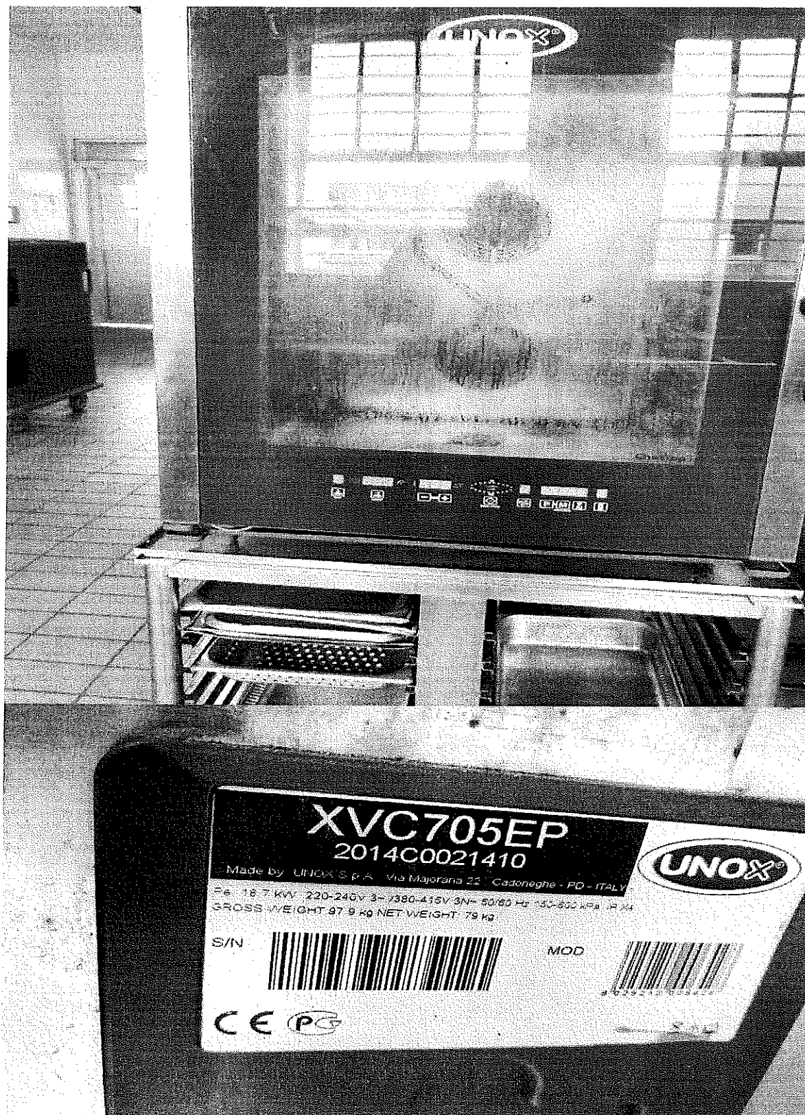
Combi Steam Oven