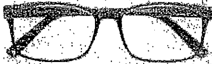
Reading Glasses | Eyecare | H... checkers.co.za