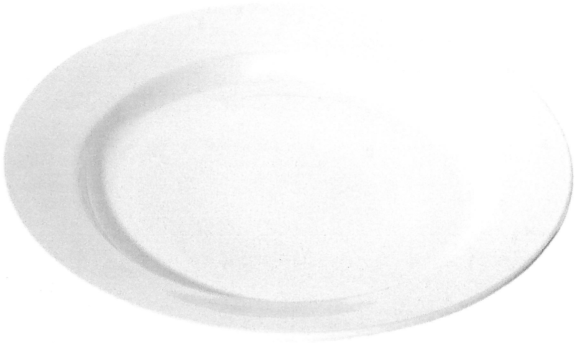
DINNER PLATE WHITE CHINA ROUND RIM PLATE 25CM