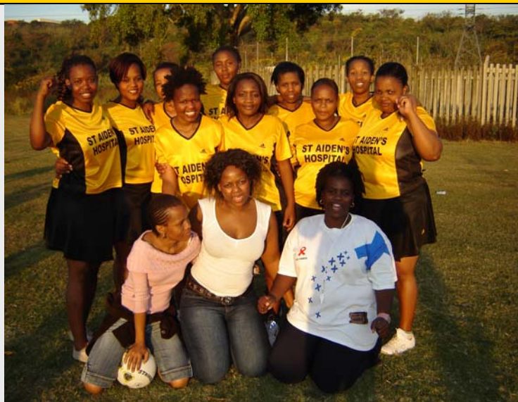
The animated St Aidan's Mission Hospital netball team after their highly successful first-time participation in the eThekweni Health District Soccer/Netball Tournament

In as much as the St Aidan's Mission Hospital teams were debutants in this tournament, they came out with their heads held high.