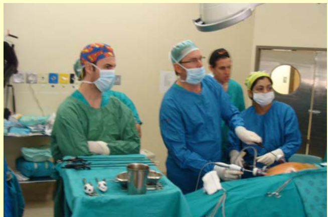
A surgical operation in progress