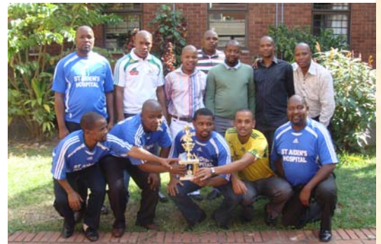
St Aidans Soccer Team. Tournament winners.