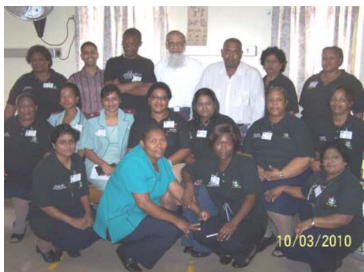
Ophthalmology doctors together with Eye Clinic team.