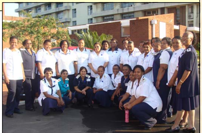
All happy students after receiving their Blue Buttons

Bridging course group 410 received their dark blue buttons after passing all examinations in their first block of training. We wish them all the best as their training continues. It is important that they stay focused for future examinations.