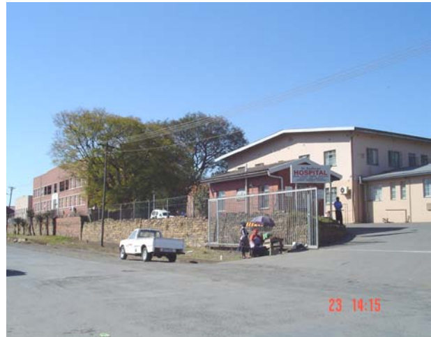
St Andrews Hospital - entrance