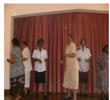
Senior staff members doing some cool dance moves at the stage!!!!