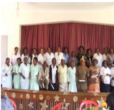
Staff members that received long service awards