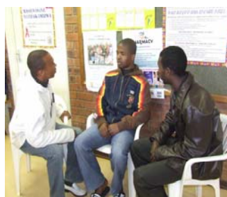
St Andrew's workers providing doing a skit on eye care and eradication of poverty