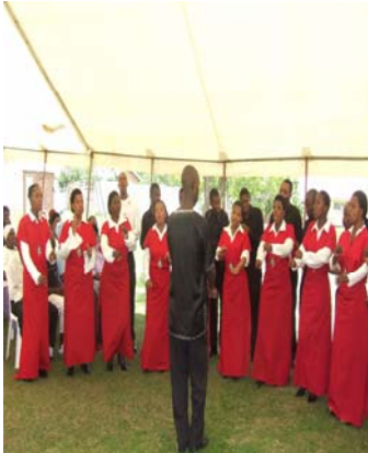
Hospital Choir singing during the Open Day event