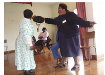
Onompilo benza iskesh ngalolusuku