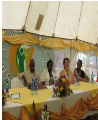
Distinguished guests who attended the Open Day