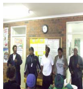
Onompilo singing for the community