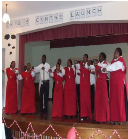
The hospital choir kept the crowd entertained all the times

Different speeches were shared as well as advises and encouragement to the community about the Crisis Centre.