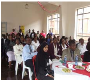
Crowd attending the Crisis Centre Launch