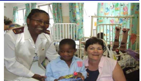
Gifts brought some smiles in the faces of the children