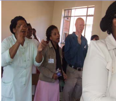
Staff members who attended the prayer

There was a candlelight and a moment of silence.