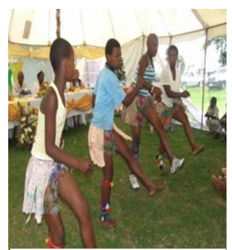
Iyashawa ingoma la!!!