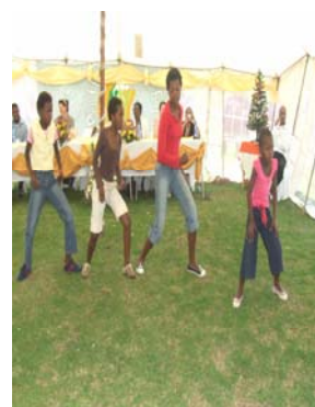
Babeziphula kanje labosisi abancane bedansela ingoma