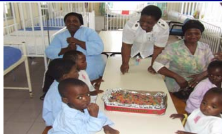
Christmas cake for children in pediatric ward

The excitement was written on the faces of children, their mothers and nursing staff.