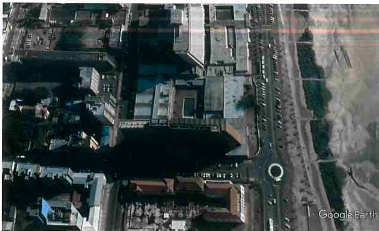
Aerial View 1: Addington Nursing Campus