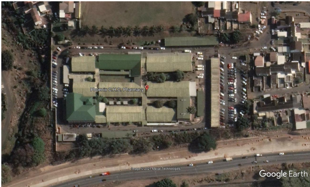
Aerial View 1: Phoenix Community Health Centre