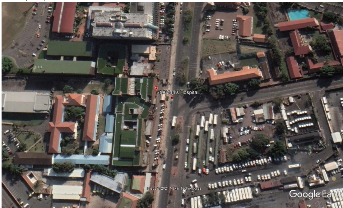
Aerial View 1: St Aidan's Hospital