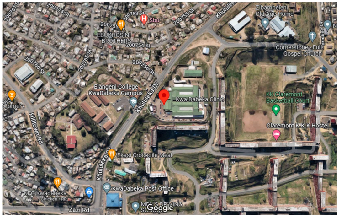
Figure 2: Kwadabeka CHC location