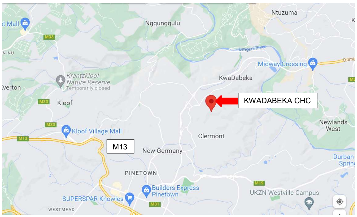
Figure 1: kwadabeka CHC Location

The Kwadabeka CHC is located on Khululeka Drive in Kwadabeka close to Pinetown and the M13.