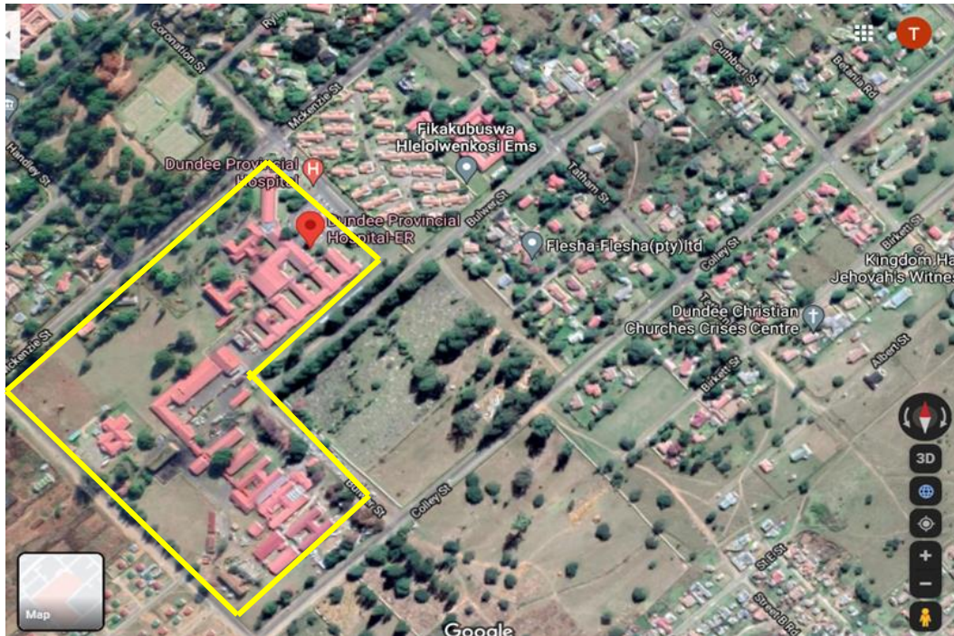
Figure 2: Ariel View showing Dundee Hospital