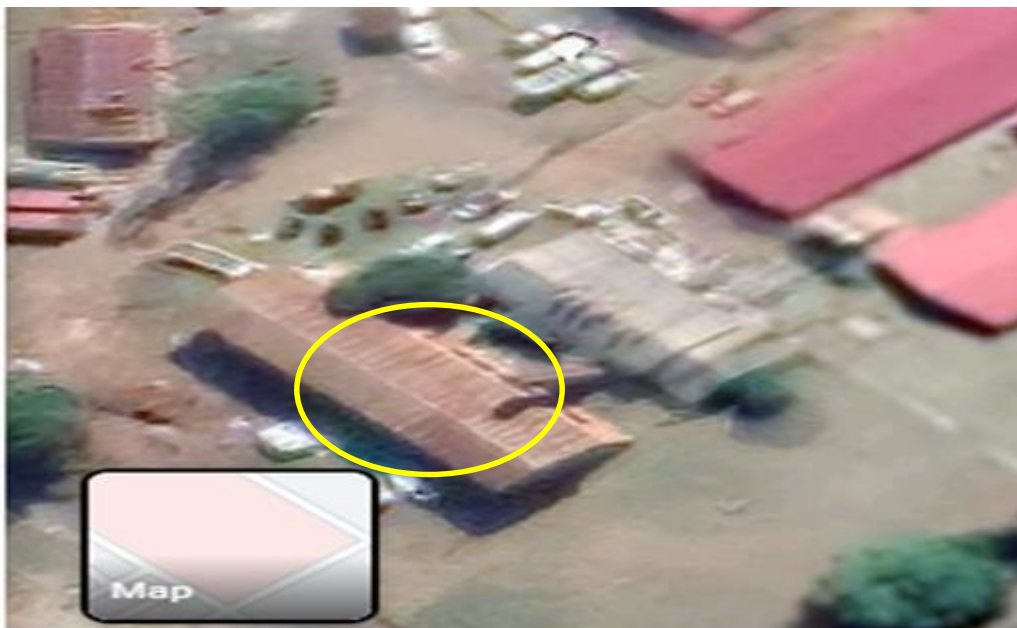
Figure 3: Ariel view showing the actual building to be renovated