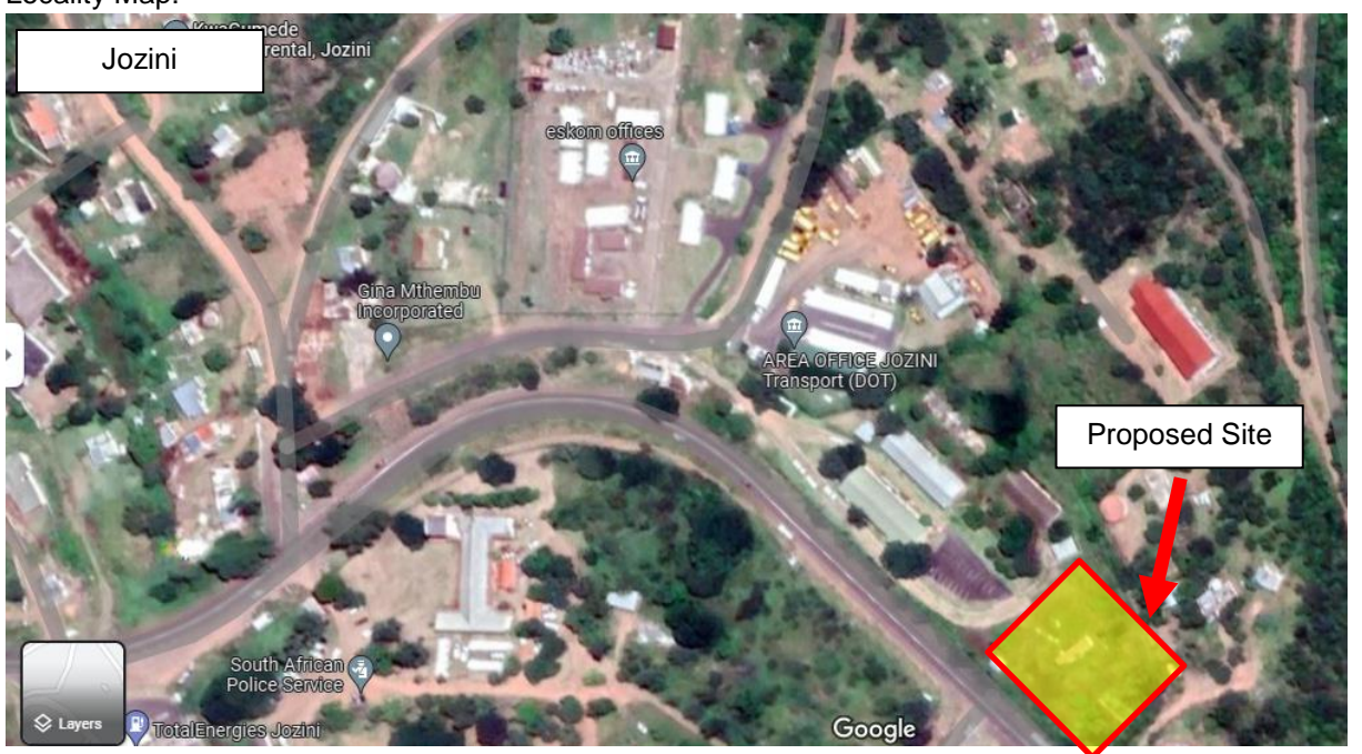
Map 1: Arial view of the Site Location