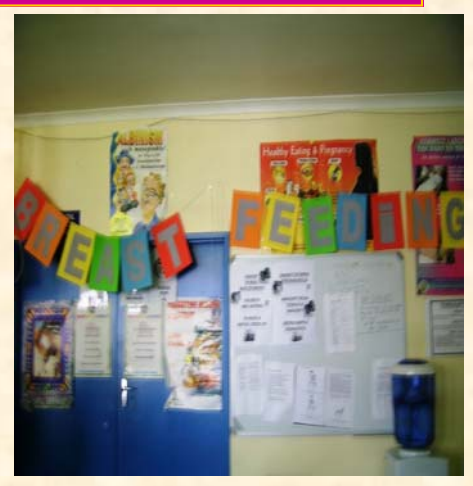
Beautiful decoration at the ANC for the Breastfeeding week

The whole week was filled with different