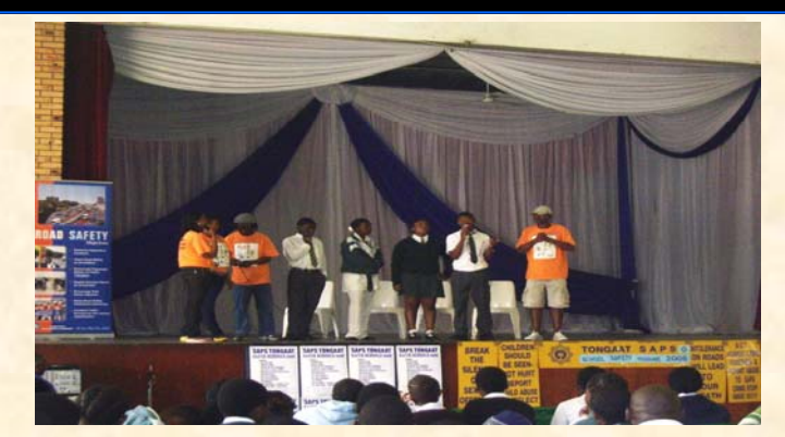
Children who participated in an educational stage