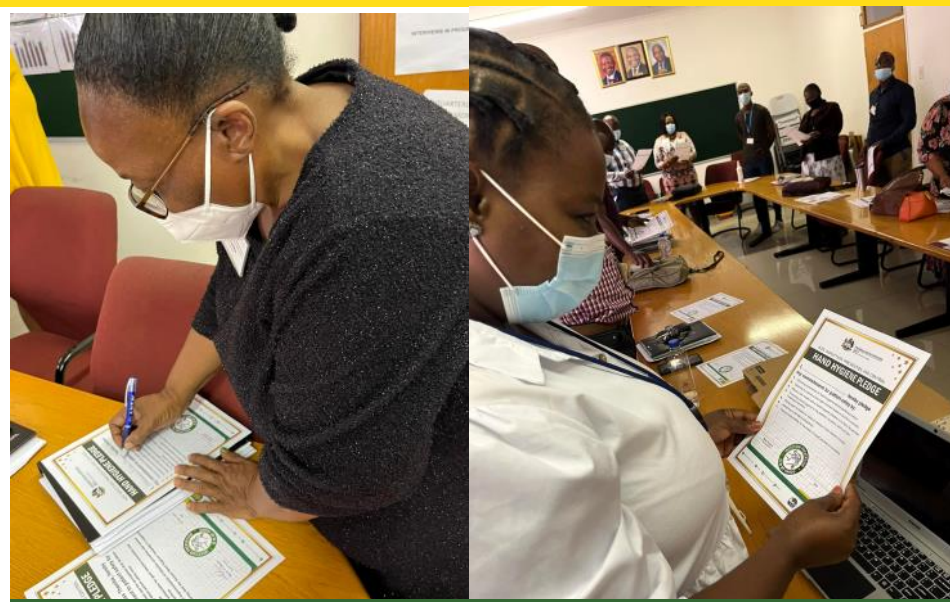
Signing of the pledge on hand hygiene and hand washing demonstration

Removing germs through handwashing therefore helps prevent diarrhoea and respiratory infections and may even help prevent skin and eye infections.