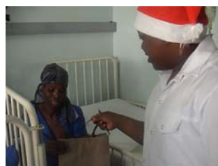
C. handing out a gift to one of the younger patient's mom.