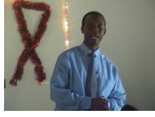
THE GUEST SPEAKER FOR THE DAY FROM NETCOM