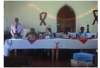
OUR VERY IMPORTANT GUESTS AT THE MAIN TABLE