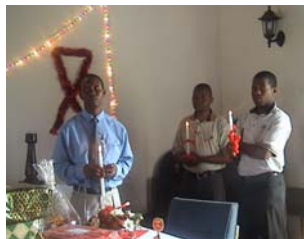
OUR GUESTS FROM NETCOM JOINING IN THE CANDLE-LIGHT CEREMONY