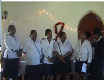
FRIENDS CHOIR SERANATED THE AUDIENCE