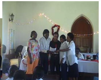
THE V.C.T. TEAM DID NOT WANT TO BE BEATEN SO THEY SHOWED OFF THEIR VOCAL TALENTS AS WELL