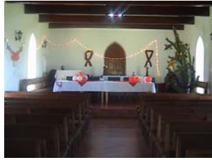
THE CHAPEL WAS ALL DECORATED AND READY FOR THE FUNCTION