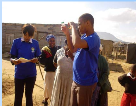
Community from R300 having their sputa collected.

As part of the Hlolamanje Manje campaign the health workers were allocated to different locations surrounding the Vryheid region going door to door, that is including the different streets and taxi ranks.