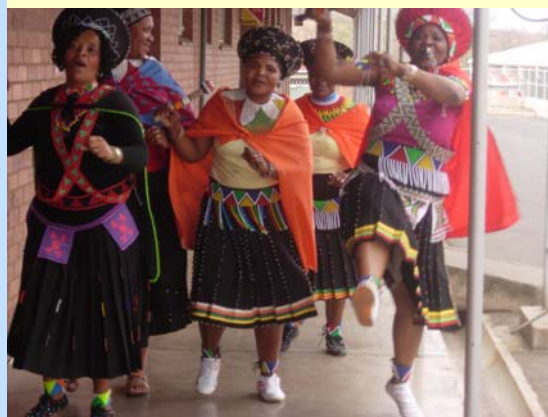
Imbokodo from Vryheid Hospital doing Zulu dancing as entertainment for the day since it was Women's month.