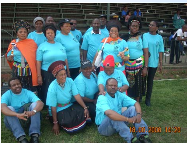
ABET learners at the Literacy Day Celebration 2008 in Vryheid High School playgrounds on the 18/09/2008.

Bethi Phansi Ngesithupha, Phezulu Ngepeni!!!!!! Congratulations. The sky is no limit.