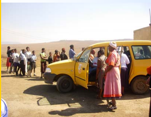
Community from KwaNgenetsheni queuing for the services.

The community we came into contact with was required to submit their sputa for TB check-ups.