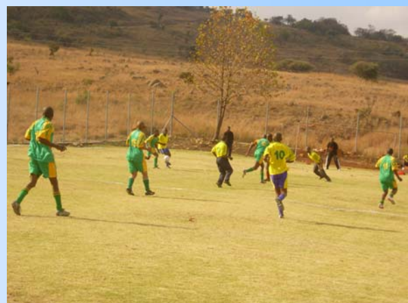
Teams at their game.