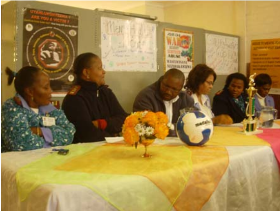
Management listening attentively to the speeches given on the day.

July was Men's Health Month. To commemorate the day knock out games were played from the 01st of July 2008 for the Cancer Cup. Teams that were participating were Finance, Systems, Nursing, PHC and EMRS.