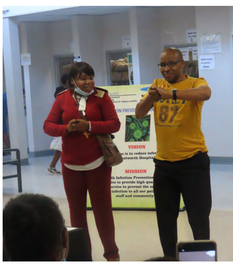
Operational manager's demonstrating the steps of handwashing

Working together with staff in the facility towards the common goal of minimizing health care associated infections and the development of antimicrobial resistance.