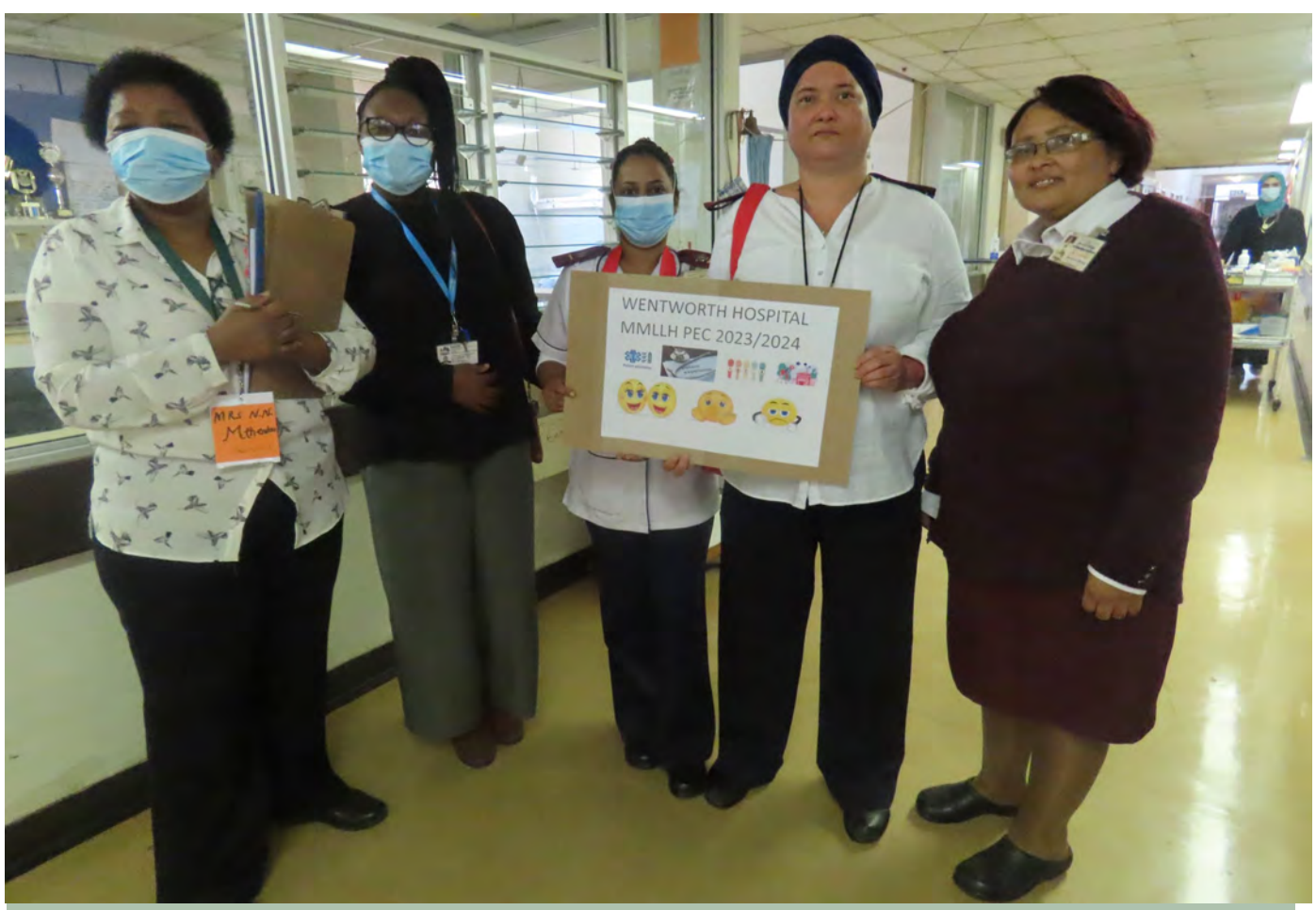
Monitoring and evaluation team during the survey

On 18 July 2023, Wentworth Hospital was visited by Clairwood hospital team to conduct the Patient Experience of care survey better known as the "PEC Survey". This survey was done in preparation for the annual PEC survey scheduled to