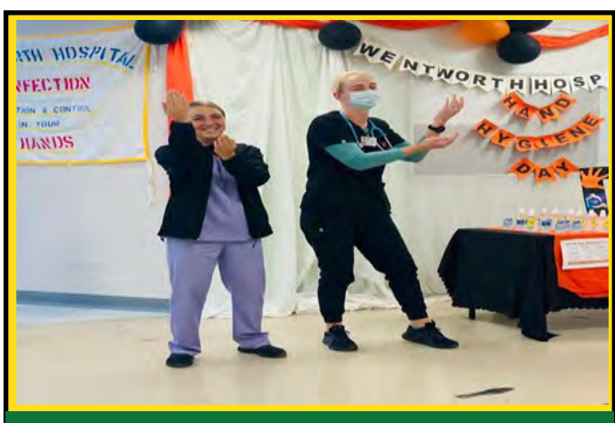
Medical Interns demonstrating hand washing