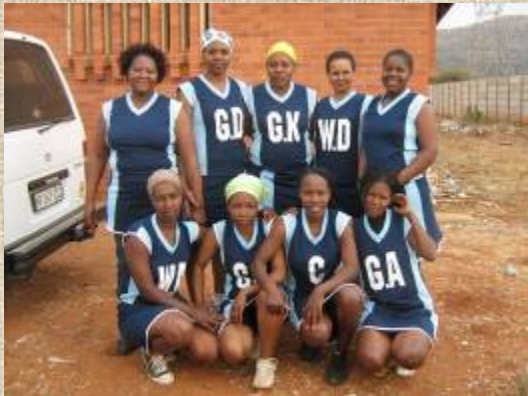
Appelsbosch Hospital netball team 2008