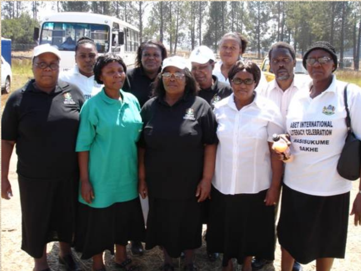
Appelsbosch Hospital ABET Learners before the event.

For more photos of Abet Literacy day: Abet photo gallery