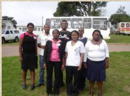
STI Awareness week Staff members that participated in school presentations