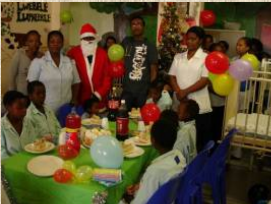
Staff members that made the event a success.