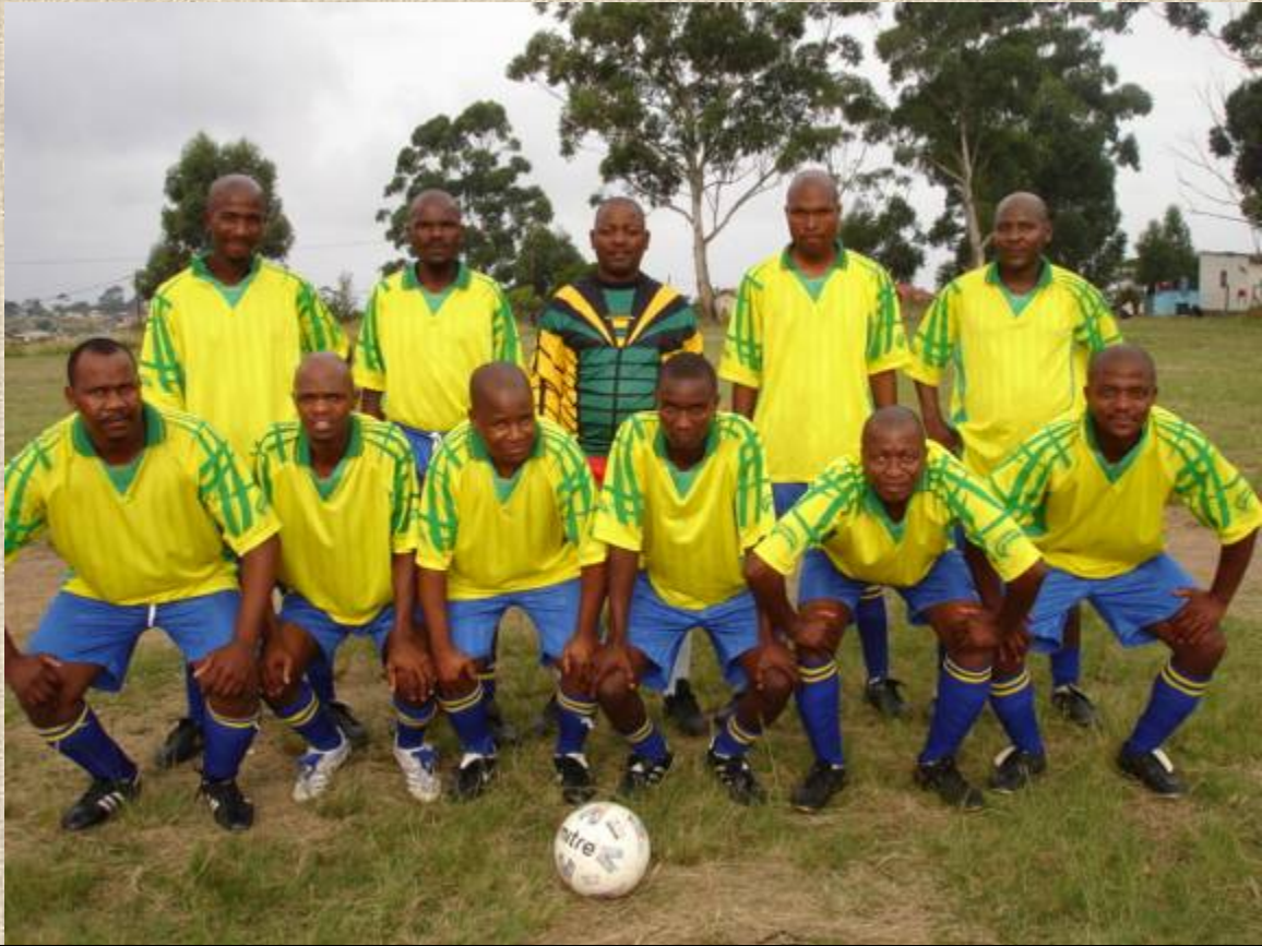
Appelsbosch soccer team 2008