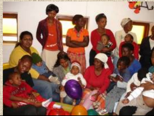
Rehab team, Parents and kids all enjoyed the day