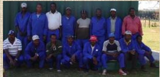
Maintenance Department staff 2008