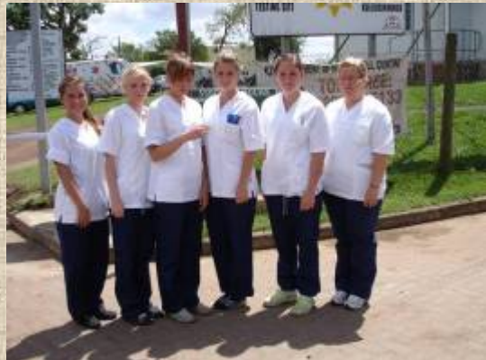
Besivakashelwe amakhosazane ase-Sweden ezokwenza in-service training for two weeks for other photos of these lovely sisters: more photos