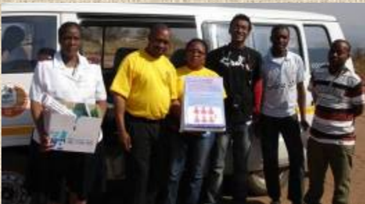
TB team during TB awareness week