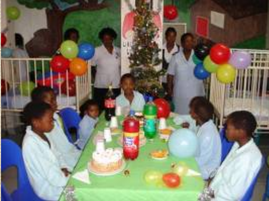
Paeds Ward staff & Kids Christmas party