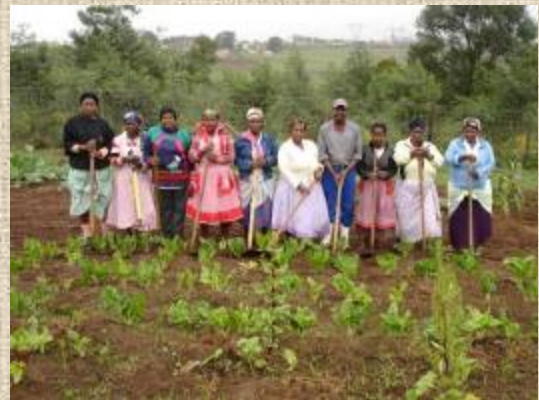
Ingadi yaseAppelsbosch Hospital iyaqhubeka ikhiqhiza wena mazambane, spinach, etc ngosizo lwamalunga omphakathi.