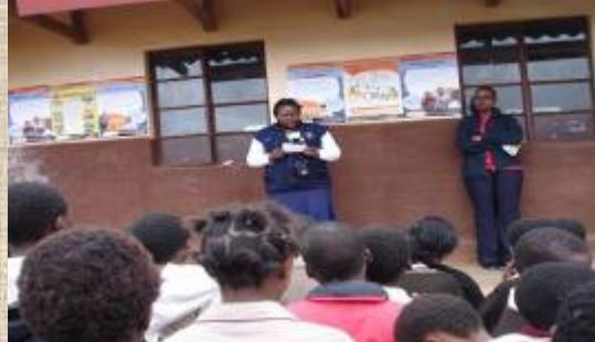
VCT team during World Aids Day doing presentations in one of the schools