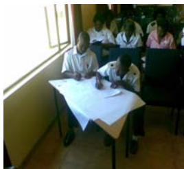
Group two 17 attended one managed to obtain 100%