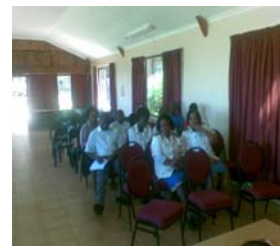
Group four 27 employees attended 12 of them managed to obtain 100%