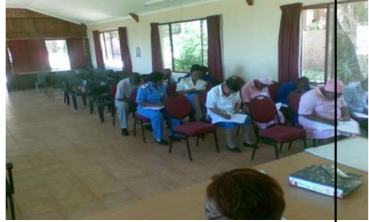
First group 18 employees attended Two of them passed with 100%

After training post evaluation test was conducted to ensure that massage was successfully relayed across.