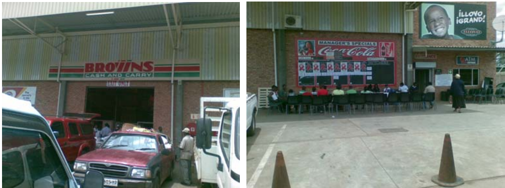
MKHUZE BROWNS CASH AND CARRY

This time Bethesda hospital was invited by one of the biggest shops around Mkuze to be part of their AIDS DAY Commemoration.