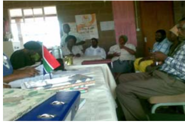
Principal and his educators as well as Governing body were also there for Assessment.

The principal of Isambane thanked everybody who made the day to be success, Parents, school learners and officials from the district and hospital