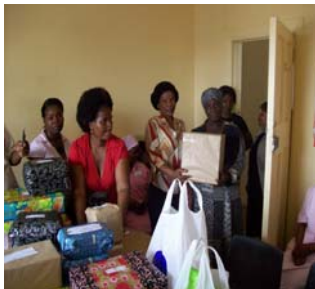
Bethesda ABET Students “Phansi ngokusayina ngesithupha”

Ukufunda nokwazi ukubhala lona umgomo kahulumeni kuso sonke isifundazwe wokuba sizikhiphe thina emaketangweni wobubha bokungakwazi ukubhala kanye nokufunda . Nalapha kulesikhungo sethu sezempilo sinabo asebewuqalile lomshikashika wokulangazelela ukuthola ulwazi. Sinabo abanye asebaphumelela baphasa umatekulestsheni( matric ) ngalo phela uhlelo luka ABET .