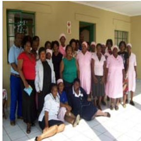
Farewell to one another till we meet again Uyazibonela izipho zigcwele itafula abafundi bephakamisa uphawu lobunye nokuzwana.