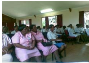
Group three 26 employees attended 10 of them obtained 100%