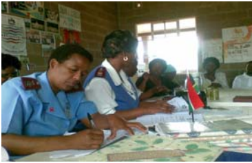
Health team from Bethesda Hospital

One of the main task for the Department of Health is to promote health within the surrounding schools. This year four primary schools were nominated under Umkhanyakude District to be assessed in order to get one to qualify as best Health Promoting Schools In October 2008 Bethesda Hospital was tasked to visit Isambane Primary School situated at INgwavuma area for assessment .On identified gaps the school would be assisted based on action plans so that on following assessment it meets the required standard and thus qualifies as an Approved accredited Health Promoting school.