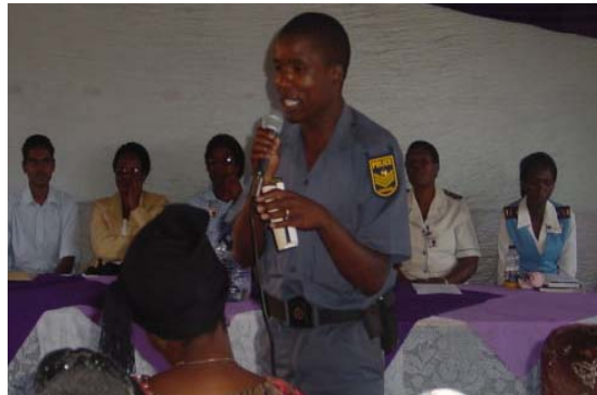
Constable Nkosi from SAPS Talked about steps to be taken after sexual assault. Incidence must be reported immediately to the parents or caregivers Come as you are do not take bath or change clothes Report the matter to the police Parents shouldn't try to negotiate the incidence between families that is illegal they may be punished for that because rape is a crime.