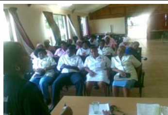
Group six 42 attended 10 of them obtained 100%