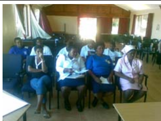
Group five 50 attended and 35 of them obtained 100%