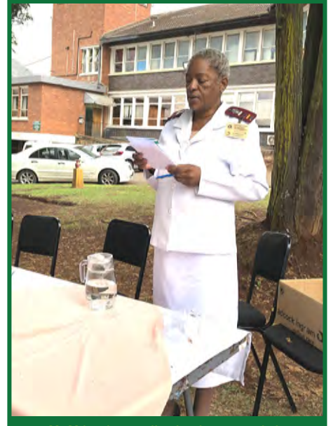
Ms Mthembu coordinating the nurses pledge