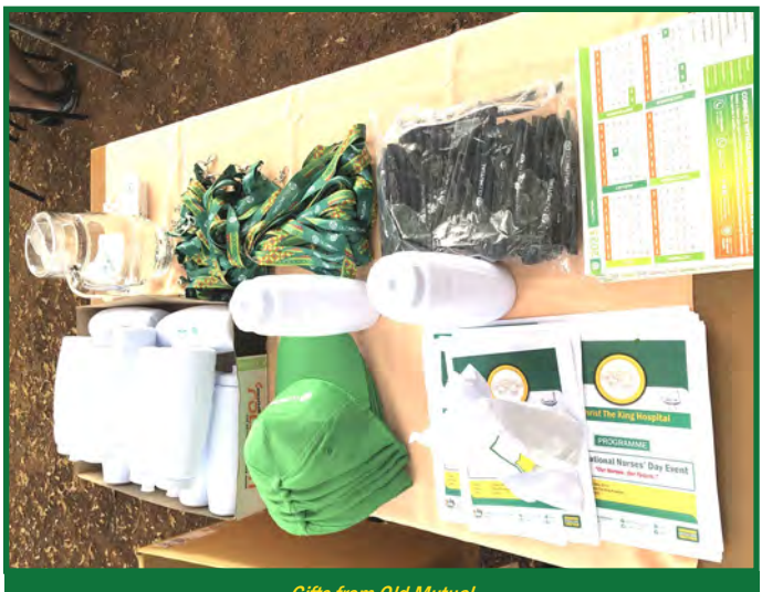
Gifts from Old Mutual