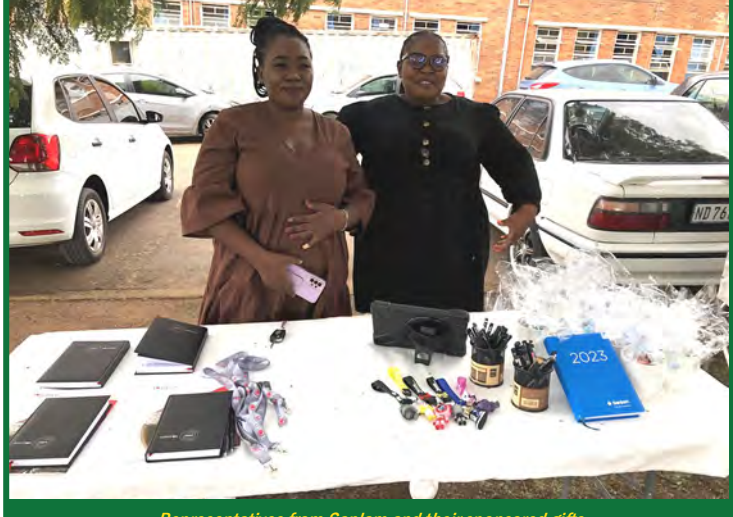
Representatives from Sanlam and their sponsored gifts