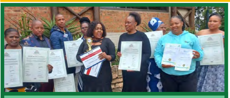
Clinic OMNs with their certificates of compliance from the OHSC