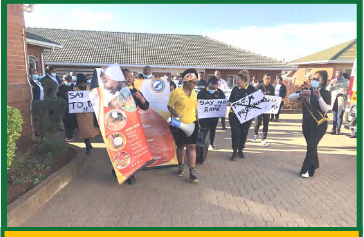
Ixopo Clinic staff starting the marching.