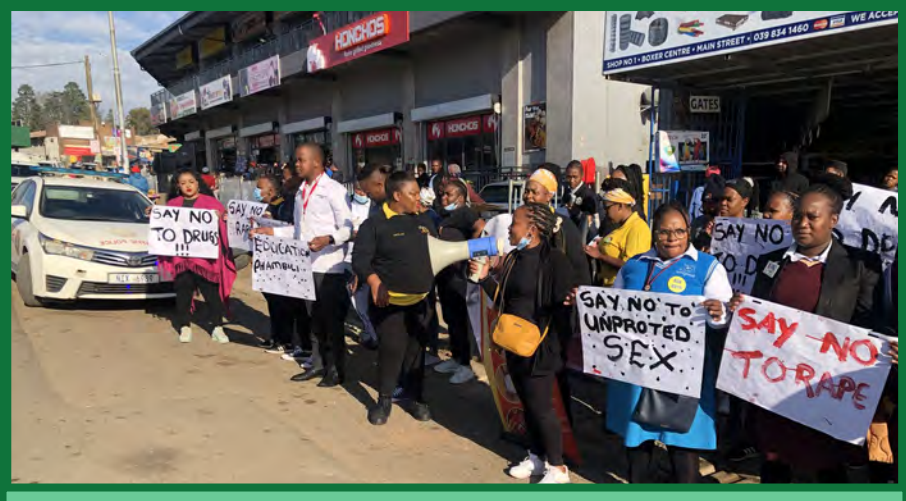
Ixopo Clinic staff and AYFS team giving health talk at the march.

Ixopo Clinic Adolescent Youth Friendly Services hosted a Youth Day march on the 15th of June 2023 from the clinic premises to Ixopo Taxi Rank as part of the Youth Day celebration.