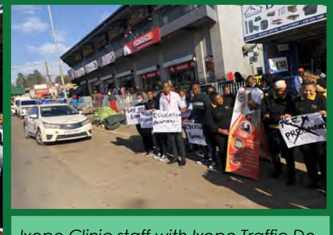
Ixopo Clinic staff with Ixopo Traffic Department.

On the 15th of June 2023. a ,march was conducted from the clinic to Ixopo Taxi Rank and back. The march was supported clinic by staff. management and LifeLine, LoveLife, Match. PSI, Uthingolwami Youth Foundation. Ixopo Traffic Department as well as Ixopo community. A 20 minutes talk was giving and it highlighted the mentioned social ills and Medical Voluntary Male Circumcision (VMMC) was touched. The community was responsive very and