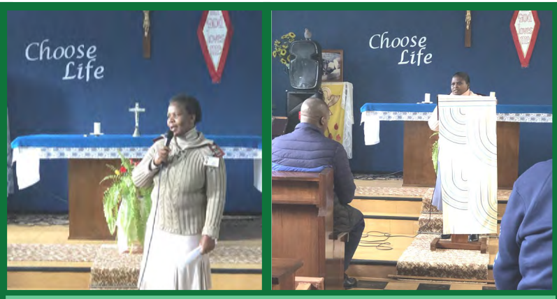
Congregants during the prayer session.