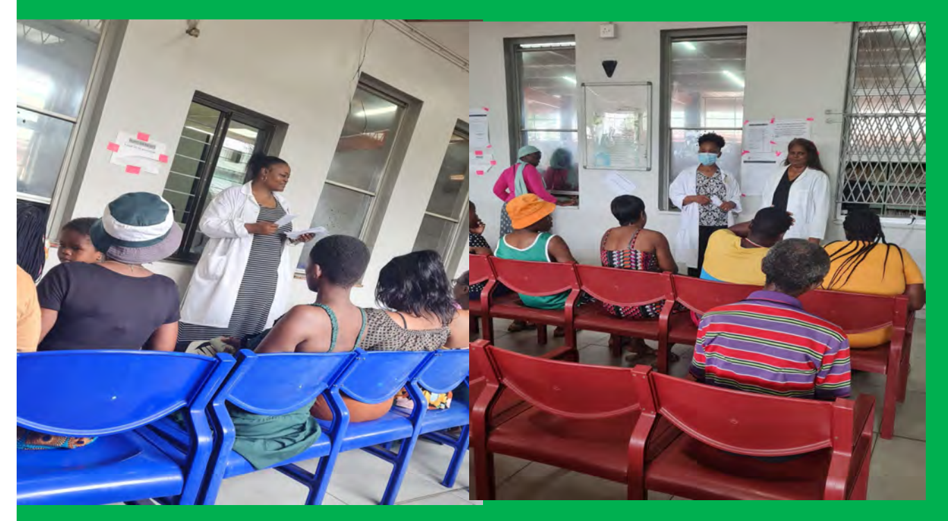
Social Workers addressing health care users during GB campaign

Social Work Department once again embarked on an awareness campaign on Gender Based Violence (GBV). The campaign which runs from 25 November up until 10 December every year with re-enforcement which is done throughout the year is so relevant in a country like South Africa where GBV is prevalent