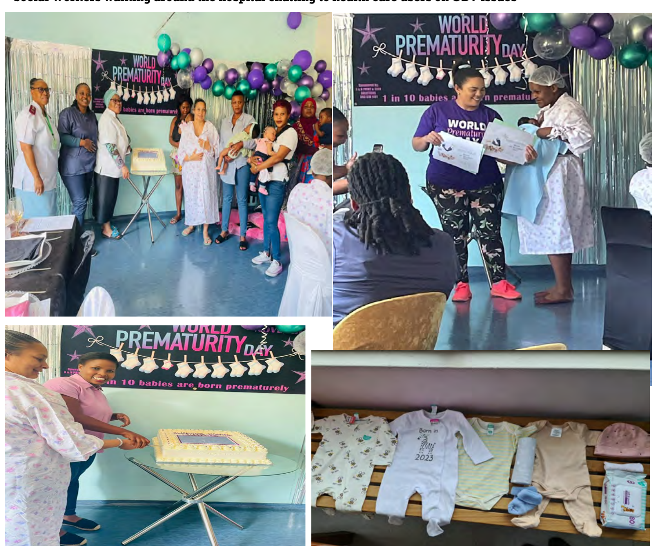
The above four pictures were taken during Prematurity day