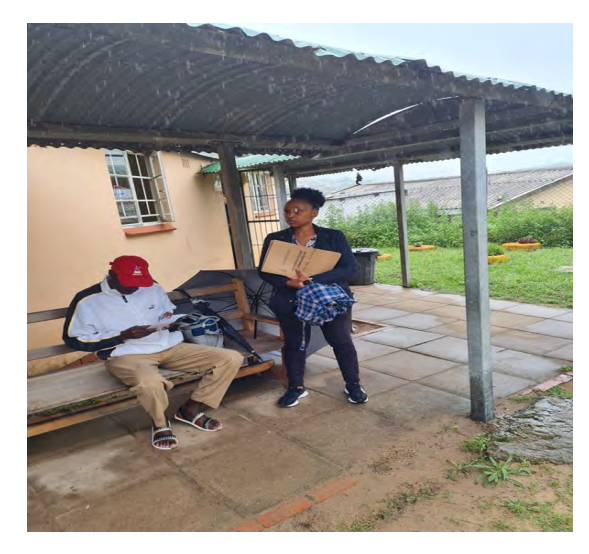
Social Workers walking around the hospital chatting to health care users on GBV issues