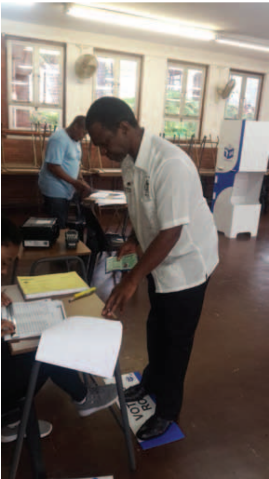
MEC VOTING ON ELECTION DAY