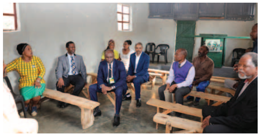
OPENING OF MKHUPHULA & MUDEN CLINICS - UMZINYATHI DISTRICT