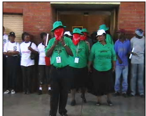
Guests were blindfolded to experience what it feels like not being able to see