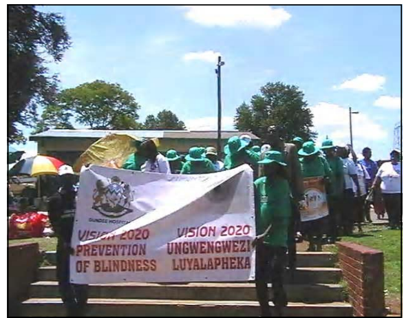
Community Members and Health Workers during the 1km walk to the hall