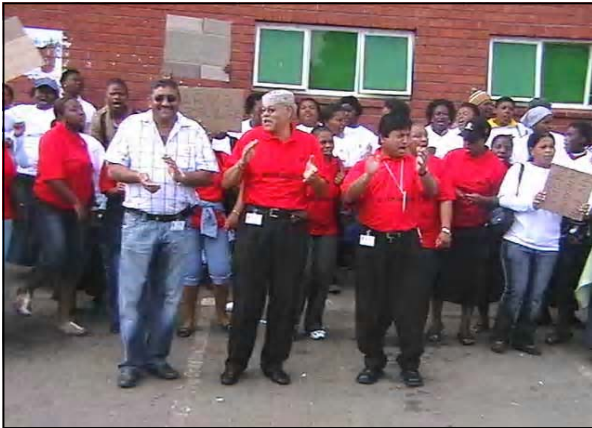
Hospital Health Workers singing praises during the Road Show