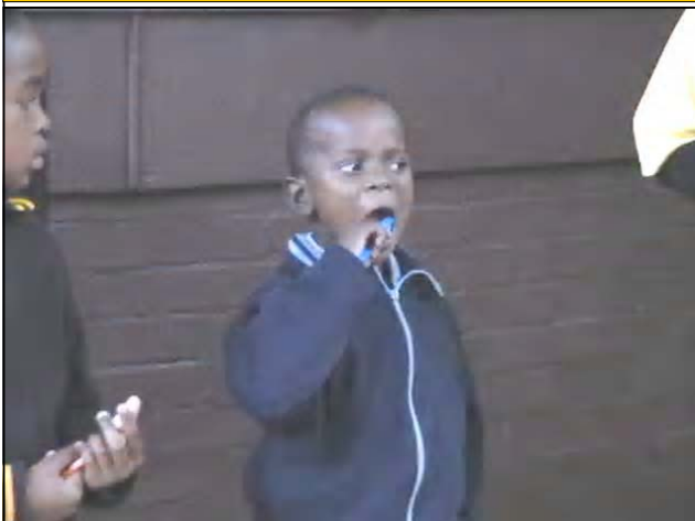
School Pupils demonstrating their brushing techniques