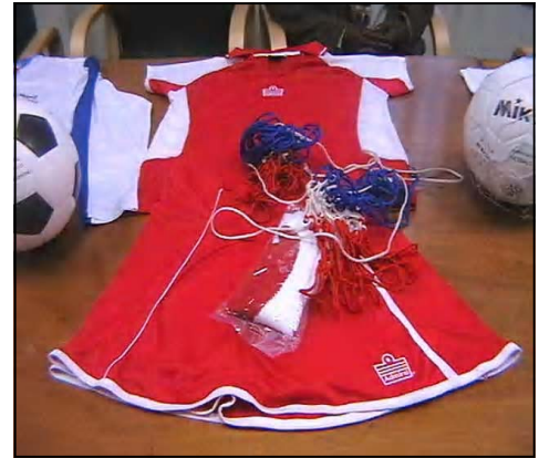
New Netball Kit

The SREC sincerely thanks management for their commitment to the staff wellness programme by purchasing of sport kits and gym equipment.