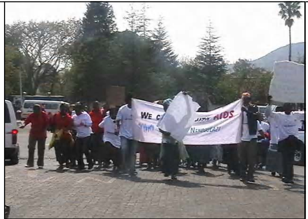
Hospital Health Workers and the community marching to the taxi rank