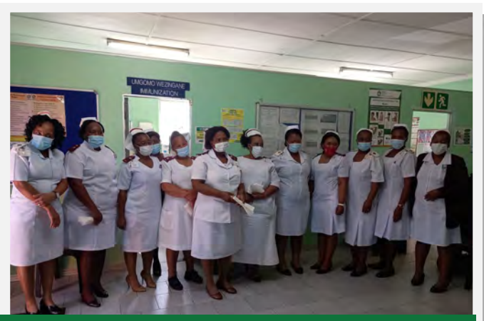
Paediatrics staff dressed in their sparkling white uniform for the Nurses day of prayer.