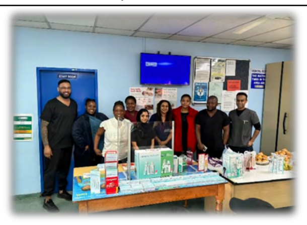
The Dental team.