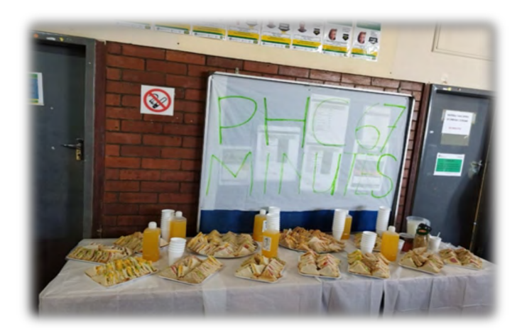
PHC Department donated sandwiches and juice for clients.