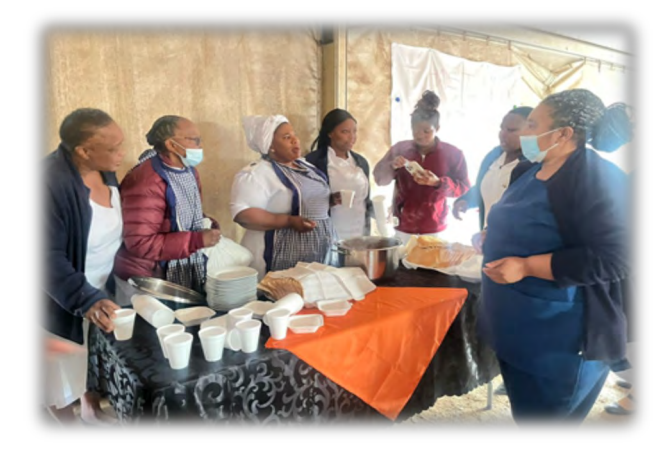
Hast Department made soup with bread for clients.