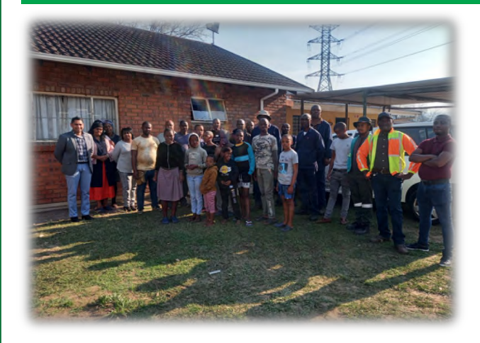
The Open Gate staff and scholars, were visited by East Boom CHC Men's' Forum.