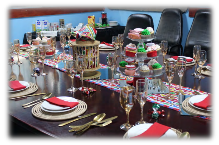
Décor for the VIPs'