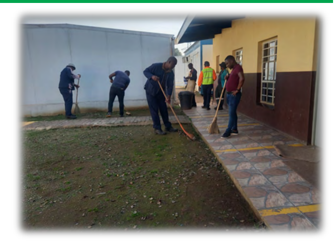
Men's' Forum did cleaning and gardening services at Open Gate School.