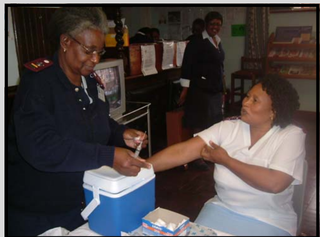
Immunization for Hepatitis B at Edendale Hospital Staff Clinic