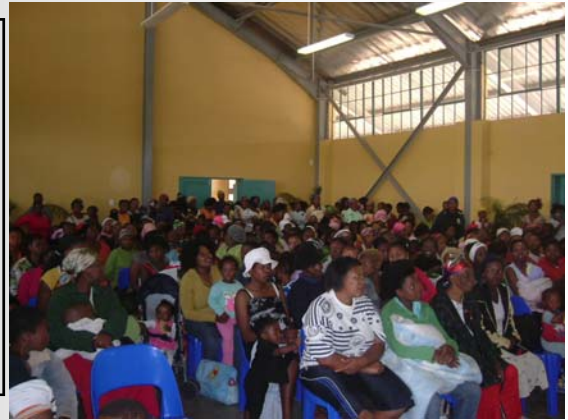
Hundreds of community members attended the Mother and Baby Edushow

On the 8th of July 2008, Edendale Hospital was invited by the Msunduzi Municipality to the Mother and Baby Edushow which was held at the Dennis Field Hall. The intention of the show was to educate mothers and care-givers about health issues in relation to the babies.