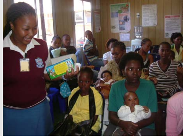
Patients in Paediatric Clinic