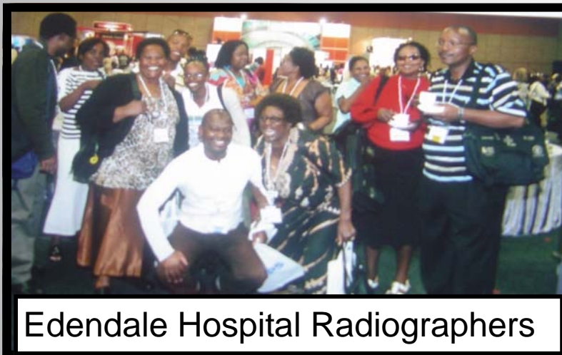
Edendale Hospital Radiographers