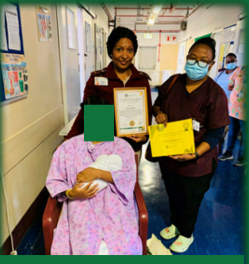
Management and KMC Team