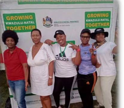
Sports Day ....page 2