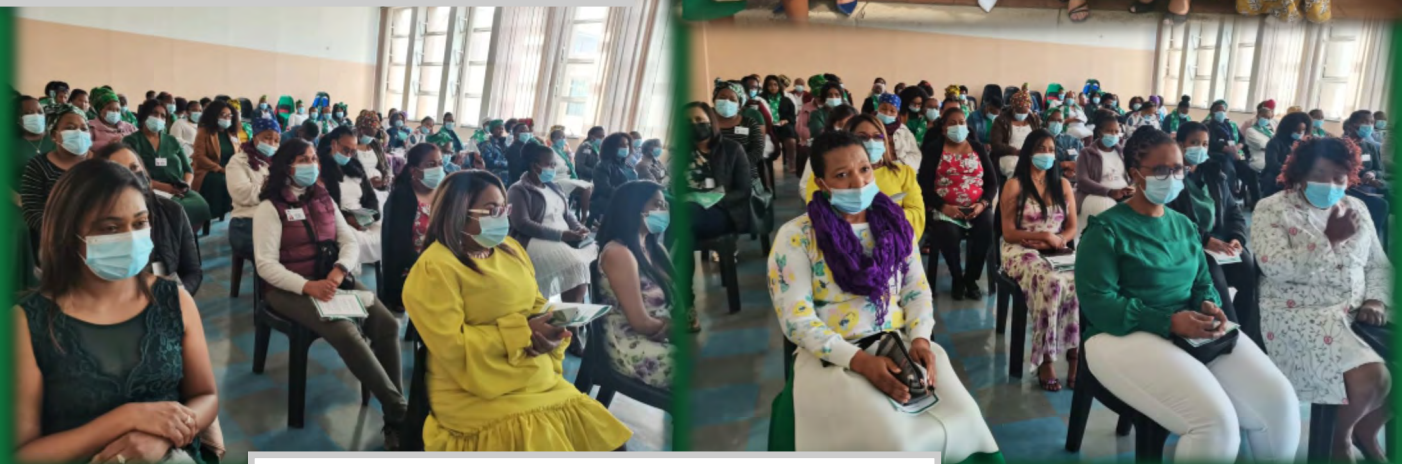
Audience listening attentively to the speeches