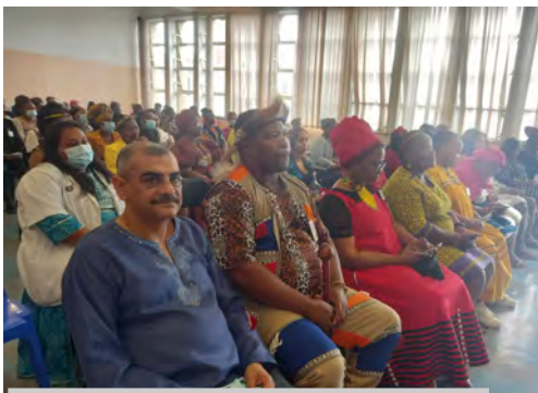
Heritage Day ....page 6