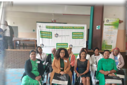
Women's Forum ....page 3