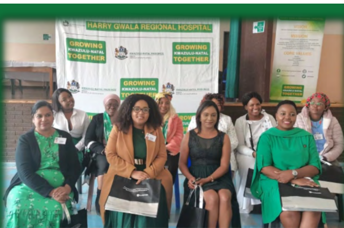
Newly elected Women's Forum for HGRH

The event opened a platform of selecting the Hospital's Women's Forum.