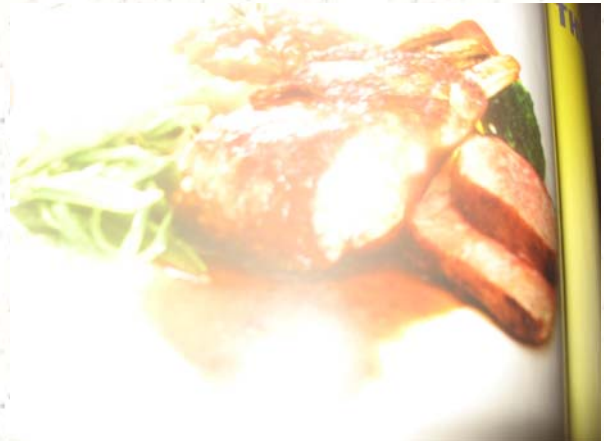
RACK OF THE LAMB