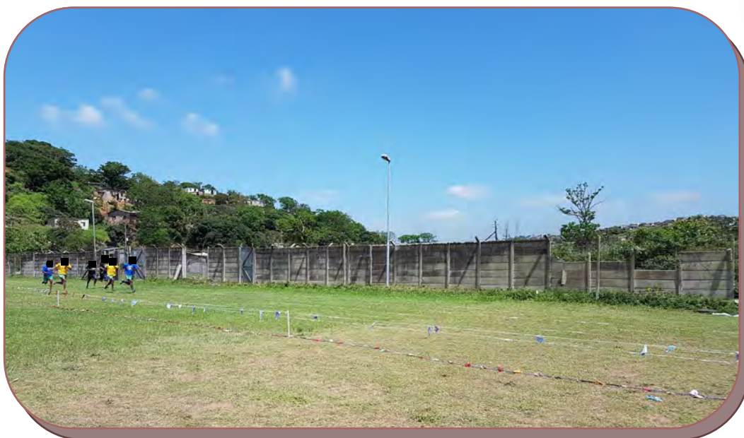
100m Sprint (Male MHCUs)