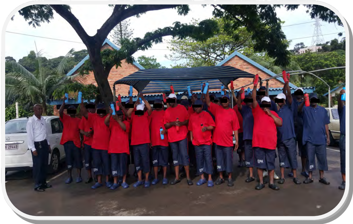
MALE MHCU'S READY FOR THE WALK WITH THEIR CAPS AND WATER BOTTLES