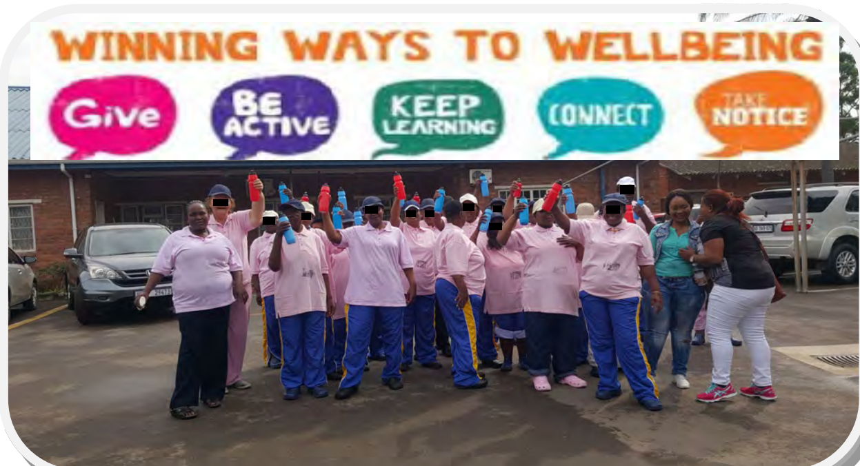
FEMALE MHCU'S READY FOR THE WALK WITH THEIR CAPS AND WATER BOTTLES