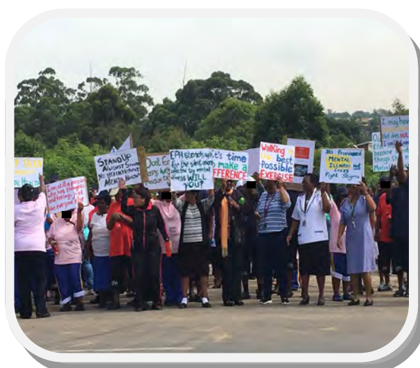
STAFF AND MHCUS CREATING AWARENESS IN THE COMMUNITY