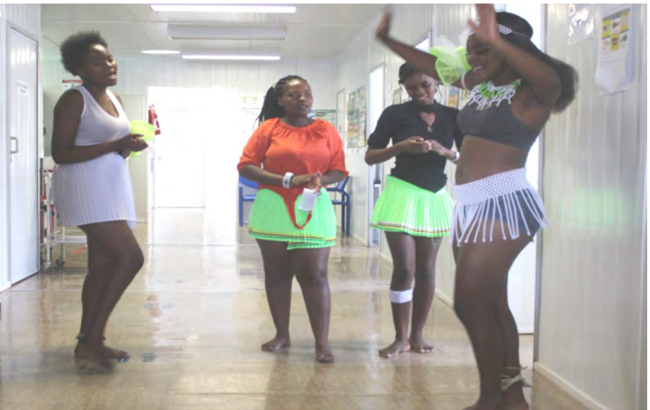
Izintombi ZaseKhaya entertaining the audience with a Zulu Dance