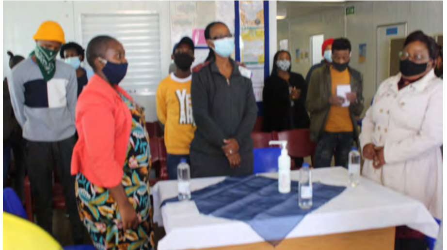
Guests from different stakeholders opening the World Aids Day with a prayer