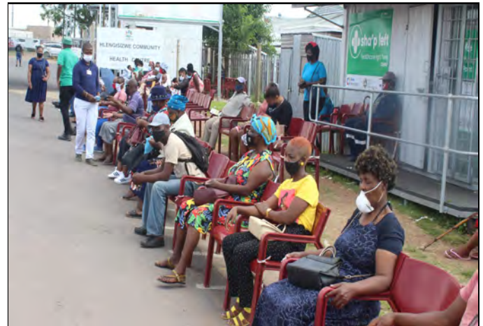
Community listening attentively to the speeches