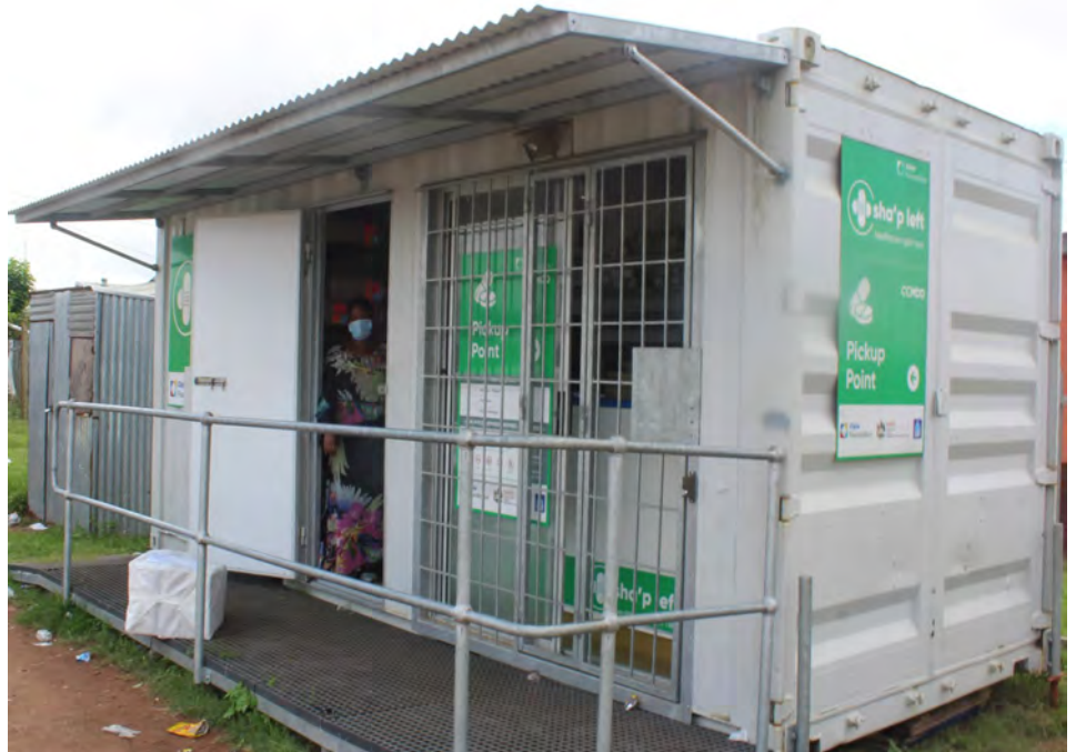
MEDIPOST container where customers collect their chronic medication in a friendly environment

UMtholampilo wase-Hlengisizwe ubambisene nenkampani iSha’p-left engaphansi kweCipla Foundation yenza kube lula ukuthola imithi ku-makhasimende ngohlelo lwe-CCMDD