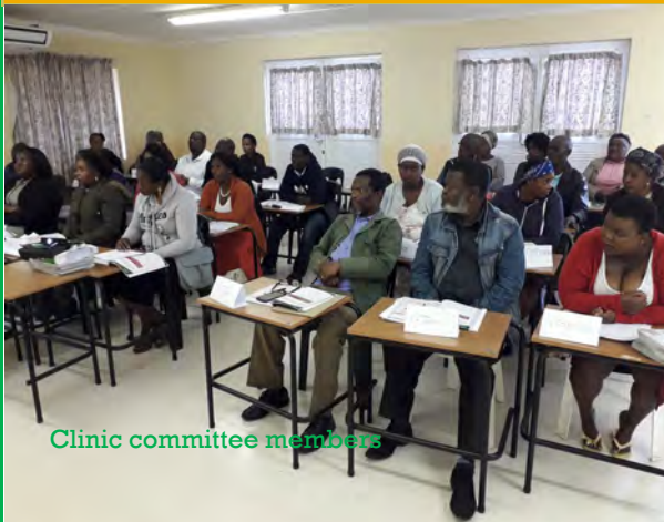
Clinic committee members