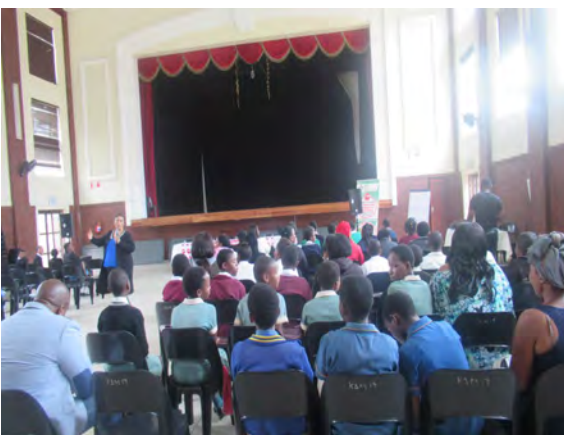
Stakeholders during dialogue